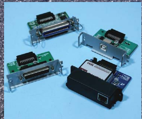
Easy to Change Interface Modules