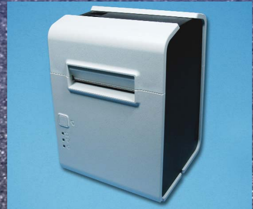
Operates Standing or Wall Mounted