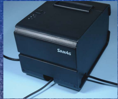
Standard Cable Management Cover