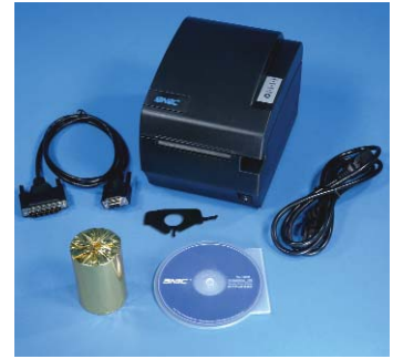
Includes Everything Necessary in the Carton