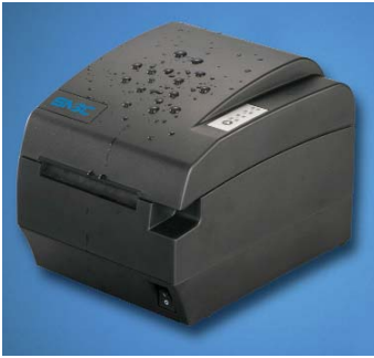
Spill-Proof Design is Especially Suitable for Kitchens and Bars