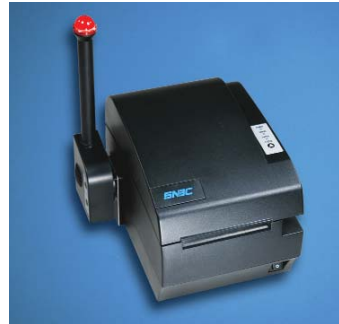
Optional Audio/Visual Print Messenger