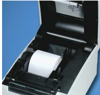
Drop and Print Paper Loading with Built-In Paper Width Selector