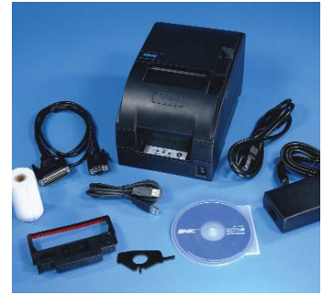
Includes Everything Necessary in the Carton