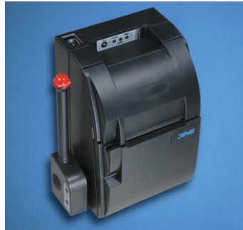
Built-In Wall Mount Capability and Optional Audio/Visual Print Messenger