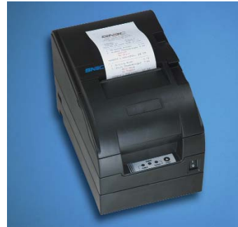
Conceal the Power Supply in the Optional Power Supply Cover